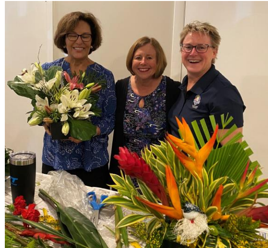
And having lots of fun!