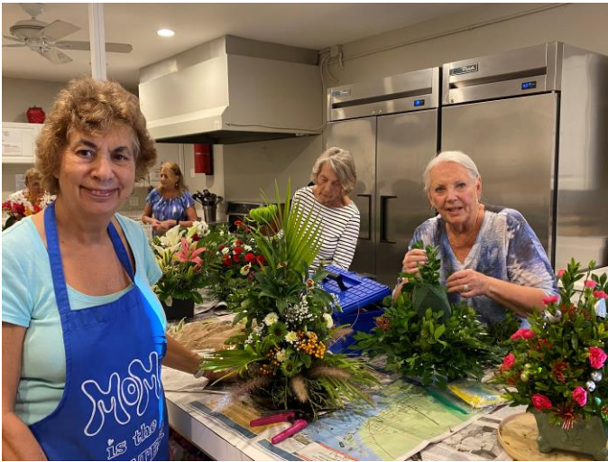
Gorgeous Christmas Arrangements!