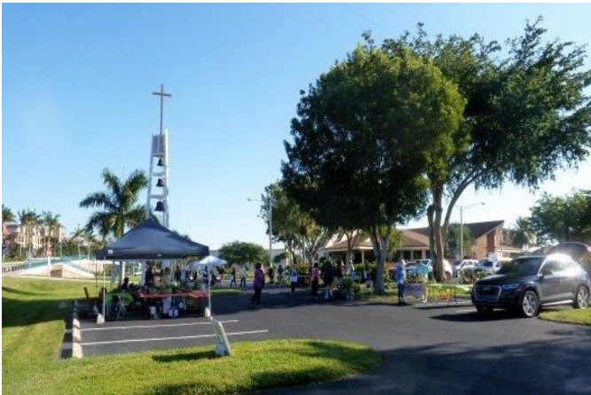
A Beautiful Day for the Plant Sale!