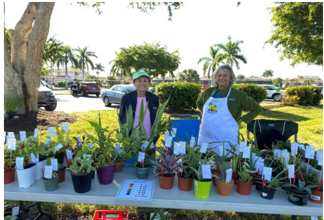
Familiar Faces Selling Plants!